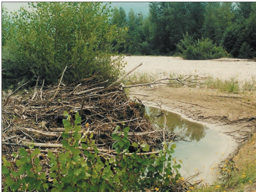
Figure 5. A well-established pioneer island with a large wood debris jam trapped against its upstream face and an adjacent scour hole that contains an ephemeral pond. The scour hole is bordered by fine sediment deposited by receding floodwaters and also by wind that has redistributed sand from the surrounding bar surface.

On the Tagliamento, ponds associated with islands pro-