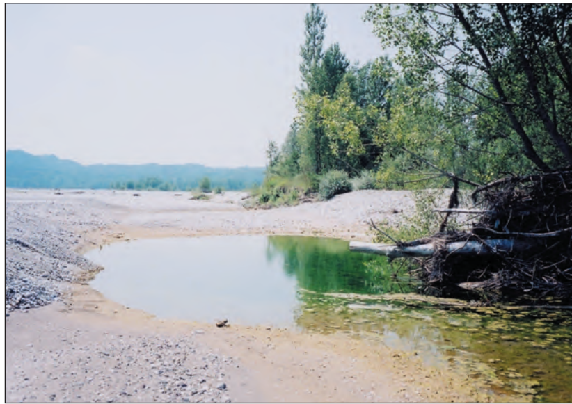
Figure 6. A deep pond at the head of an island on the Tagliamento River, showing a massive wood jam. The islands form a complex patch within an extensive expanse of bare gravel (view looking downstream).

We contend that island-braided rivers, although rare today, would have been a common style of gravel-bed river before the introduction of river engineering and flow regulation for water supply, flood control, hydroelectric power production, and navigation. Historical records support this contention for Europe (Gurnell and Petts 2002; Tockner et al. 2003) and North America (Maser and Sedell 1984), and research on impacts of dams has illus-