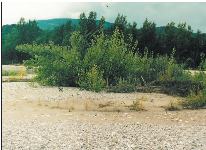
Figure 2. Early regrowth of poplar ( Populus nigra ) from a tree deposited by floodwaters along the Tagliamento in the second growing season, showing over 2m of growth.

The build-up of wood and coarse sediment around the root bole, the adjacent scour hole, and sand plume may develop over a sequence of inundations. Given suitable tree species and environmental conditions, some wood pieces and the core deposited tree may sprout, developing root networks that reinforce the accumulating sediments and a canopy that