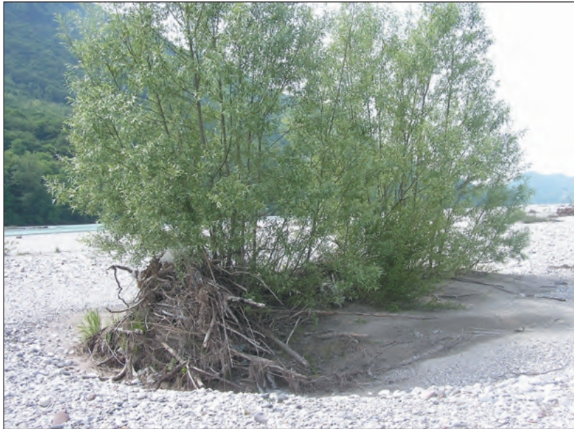
Figure 4. A pioneer island developing from a single buried willow, showing the features described in Figure 3b with wood debris accumulating around the root bole, gravel scour around the growing debris jam, and fine sediment deposition downstream.

deposited trees (<1 year since deposition) and 22 pioneer islands (2–5 years) and showed that, on average, 17.3 (sd = 1.1) plant species were associated with the former and 26.2 (sd = 2.1) species with the latter. They also showed that the association between the number of plant species and habitat area was sustained across the developmental sequence of island types (deposited tree → pioneer island → building island → established island).