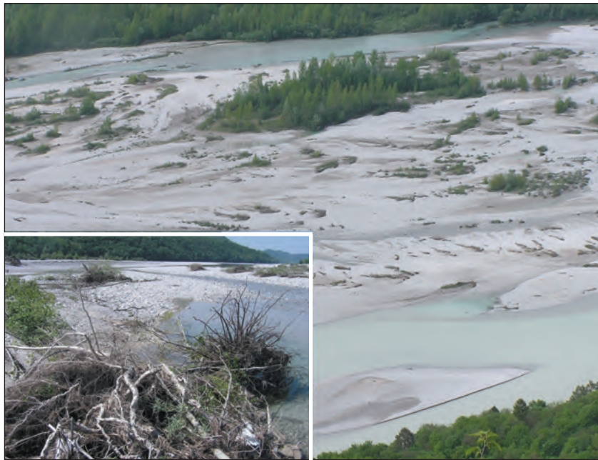
Figure 1. An island-braided section of the Tagliamento River, Italy. Pioneer islands surround the established island, with newly deposited trees draped across the bar adjacent to the main channel (foreground). The inset shows trees deposited across an expanse of bare gravel by a recent flood.

developed a model of island formation downstream from an initial deposited tree or wood jam at the head of a mid-channel bar and eventual integration of the island into the floodplain. This island development model was driven by the accumulation of dead wood and the growth of vegetation from propagules deposited in the protected lee of the wood. In such locations, the wood supports vegetation growth by acting as a “resource node” (Pettit and Naiman 2005), where fine sediments accumulate, retaining moisture and nutrients from the decomposing plant material. From